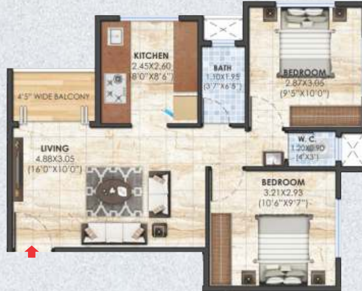
C wing - Unit Plan 2 BHK Flat C - 105, 205, 305, 405 & 505, 605, 705, 805