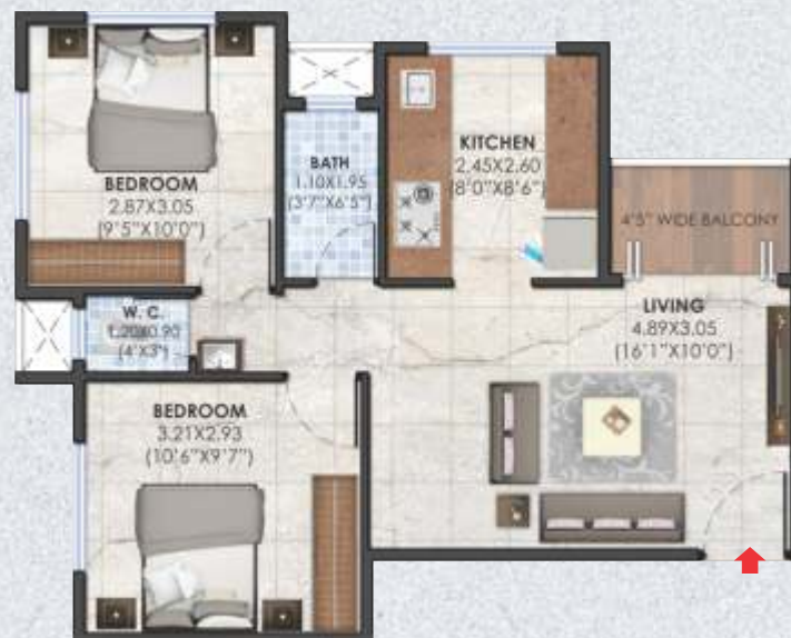
B wing - Unit Plan 2 BHK Flat B - 104, 204, 304, 404 & 504, 604, 704, 804