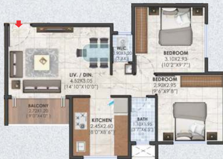
D wing - Unit Plan 2 BHK Flat D - 101, 201, 301, 401 & 501, 601, 701, 801