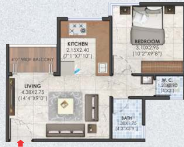
B wing - Unit Plan 1 BHK Flat B - 106, 206, 306, 406 & 506, 606, 706, 806